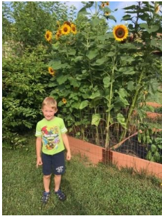
Sunflowers from our garden!

The children of Little Hands Preschool look forward to sharing their activities throughout the school year!